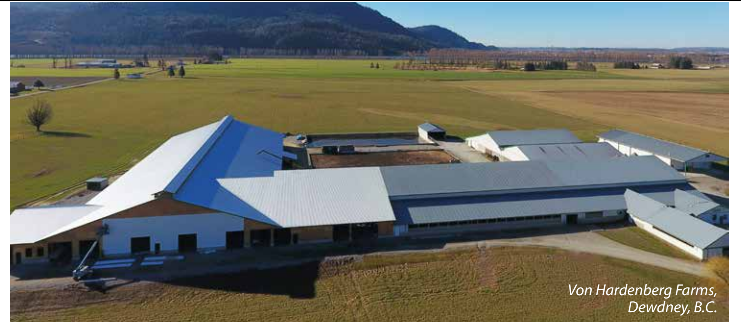
Von Hardenberg Farms, Dewdney, B.C.

Progressive farmers are excellent at prioritizing and managing their operations. Studies show that the most sustained success comes from doing 20 things 5 percent better,